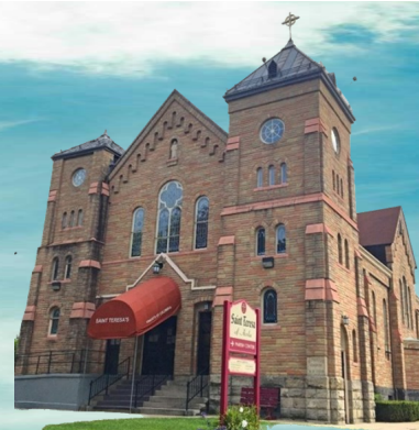
Saint Teresa of Avila Church 9 Third Avenue Union City, PA 16438