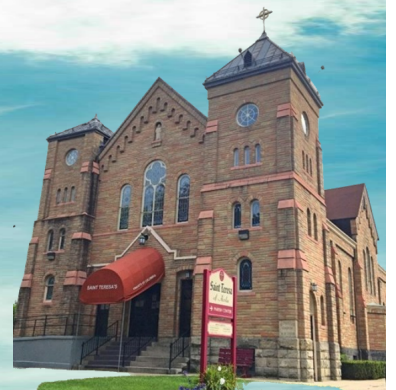
Saint Teresa of Avila Church 9 Third Avenue Union City, PA 16438