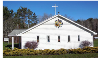
Our Lady of Fatima Church 36198 Lake Road Union City, PA 16438