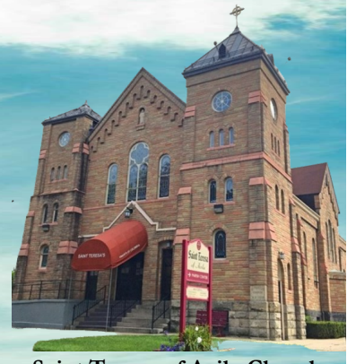
Saint Teresa of Avila Church 9 Third Avenue Union City, PA 16438