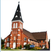
Saint Thomas the Apostle Church 203 W. Washington Street Corry, PA 16407