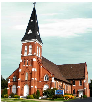
Saint Thomas the Apostle Church 203 W. Washington Street Corry, PA 16407