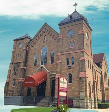
Saint Teresa of Avila Church 9 Third Avenue Union City, PA 16438