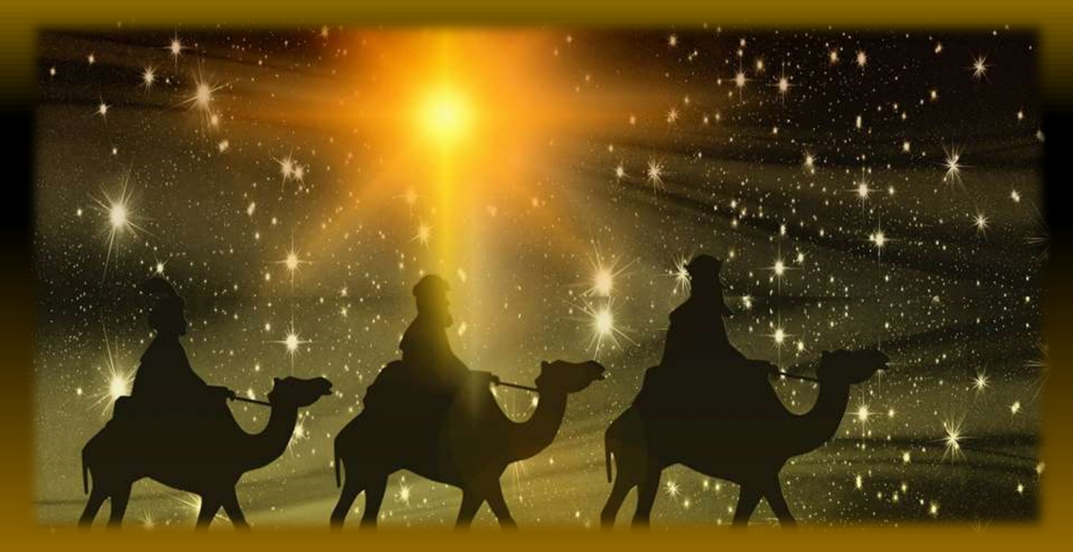
January 5th, 2020