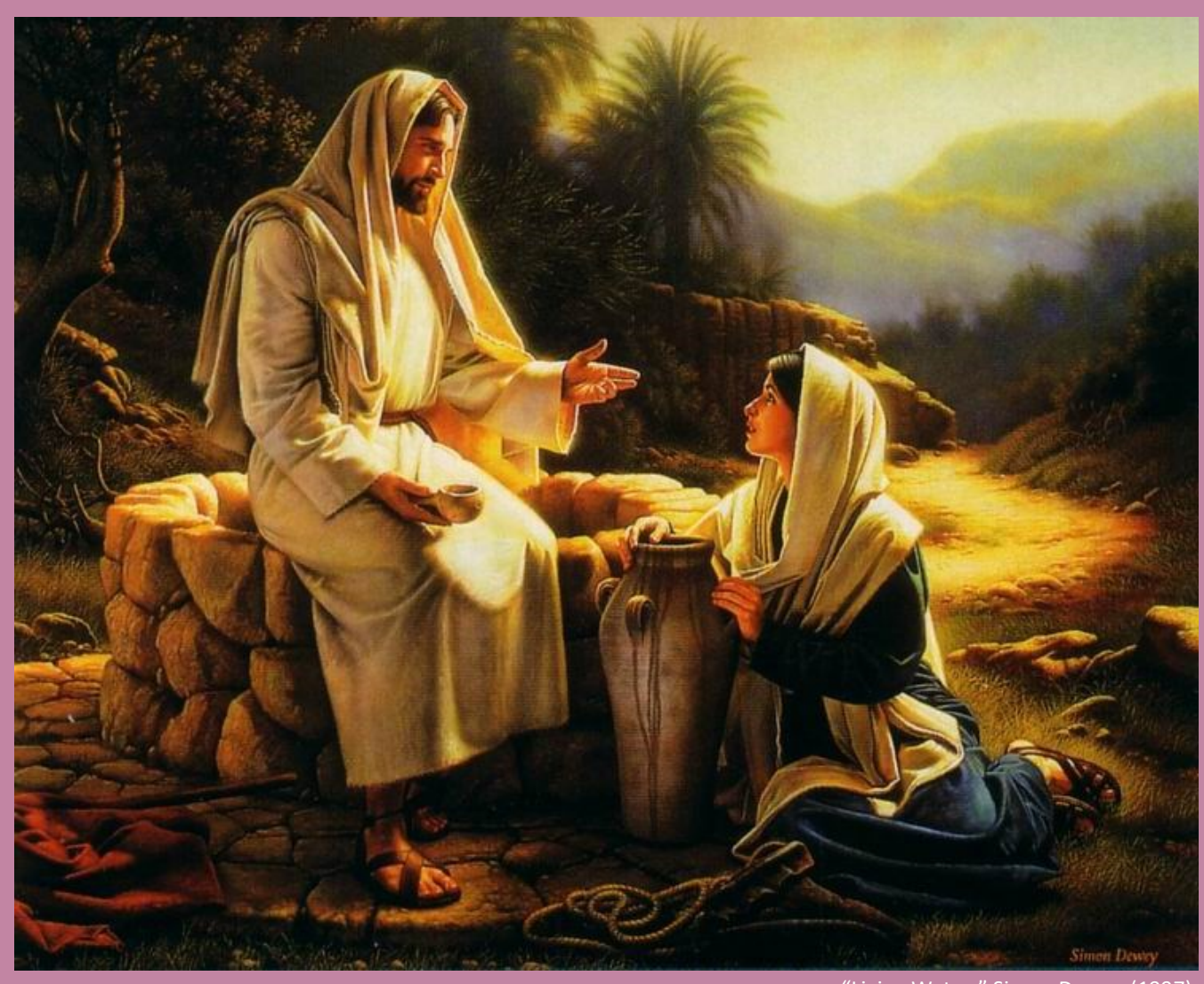
"Living Water," Simon Dewey (1997)