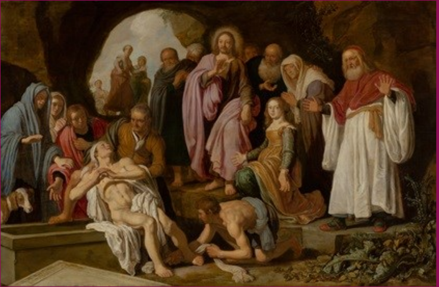
“The Raising of Lazarus,” Pieter Lastman (1622)