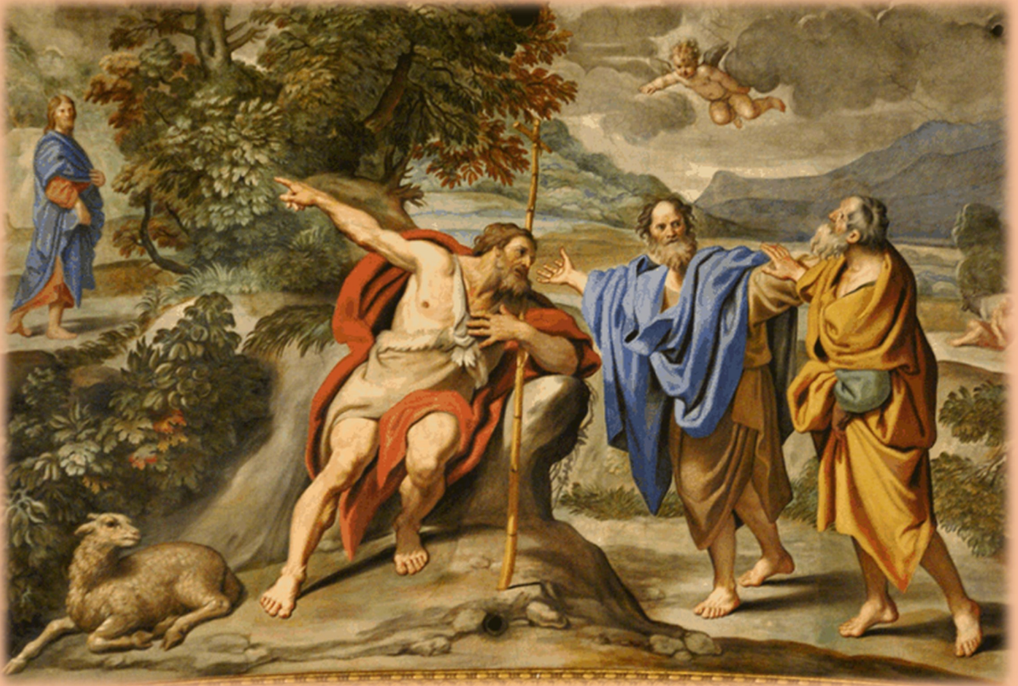
“Behold, the Lamb of God,” by Domenico Zampieri (1581-1641)