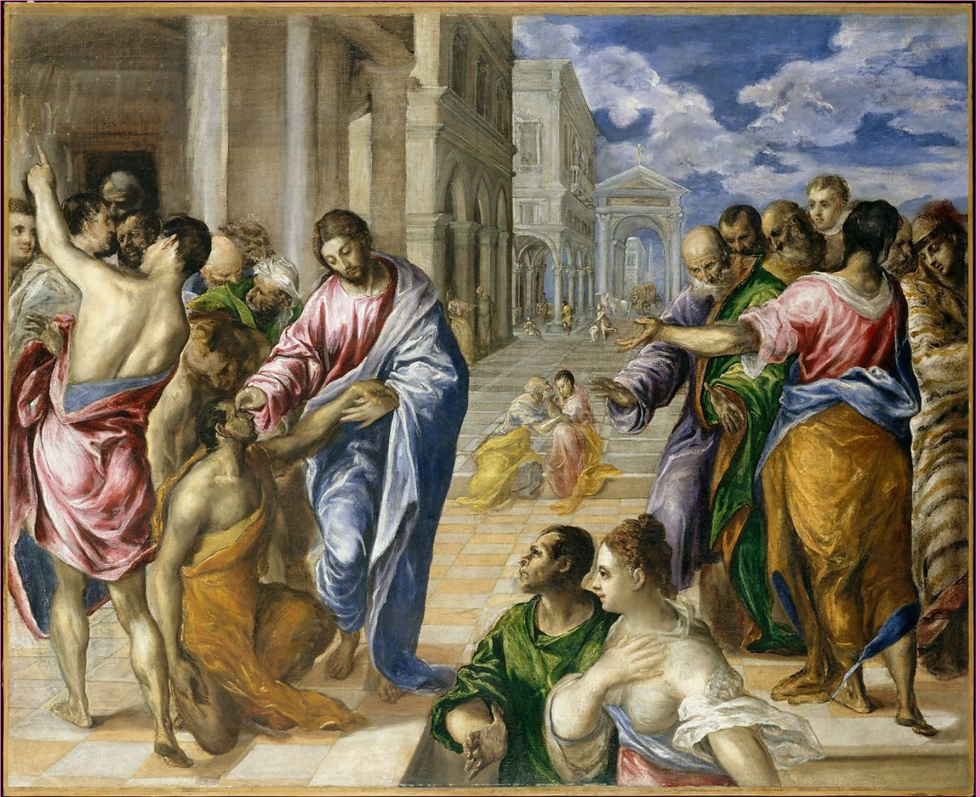
"Christ Healing the Man Born Blind," Doménikos (El Greco) Theotokópoulos (1573)