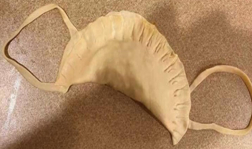
Polish Face Mask

Being a mom means... laughing in a fit of hysterics, screaming like a lunatic, crying in sadness, beaming with pride, being frantic with worry, wanting the day to speed up but time to slow down, feeling the need for personal space but also begging for more snuggles... all within a period of 24 hours.