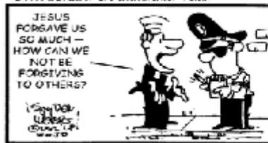
24TH SUNDAY IN ORDINARY TIME