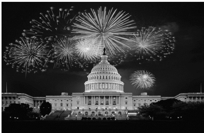
Fireworks over the Capitol, Washington, D.C.

TAKE OUT ONLY Masks MUST be worn and social distancing will be maintained