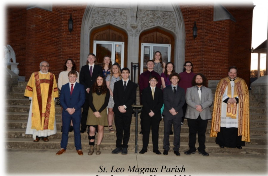
St. Leo Magnus Parish Confirmation Class, 2021