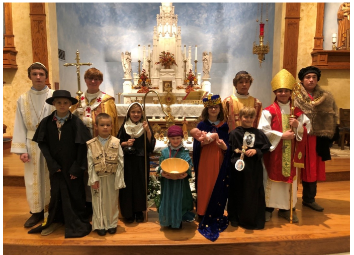
St. Leo School students celebrated All Saints Day by dressing as their class saint. Can you guess who they are?

It is a busy time. Consider this: a weekend away after the holidays to just be the two of you - husband & wife - and refocus on being that couple. Worldwide Marriage Encounter Weekend is a faith-based enrichment for any married couple. Next is February 9-11, 2024, Hampton Inn & Suites, Grove City, PA. Application fee is $75. Scholarships are available. Go to www.WWME.org for more information and to apply.