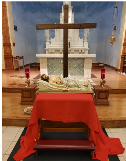
St. Leo Good Friday Service Prayers before the Crucified Christ