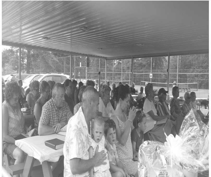
St. Elizabeth's picnic in the park Celebrating 150 years. July 14, 2018