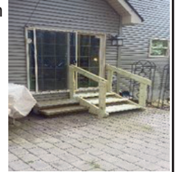
(R) New steps for entrance.