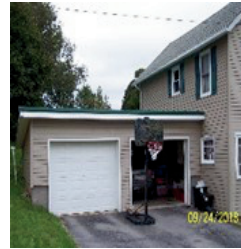
(L) After-insulation fixed.

Projects requests were submitted to the committee in early spring, 2018, reviewed by the volunteers, and worked on during the summer. Insulation projects, building a set of stairs, and paint jobs were part of their work. Serving Hands will be back at work this spring and summer, 2019! Thank you for your efforts!