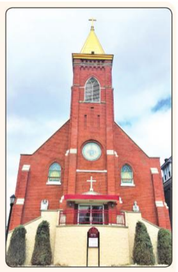
15 Robinson Street DuBois, PA. 15801

St. Michael: 8 a.m. and 5:15 p.m. Please check bulletin for Mass times on Christmas and New Year's Day.