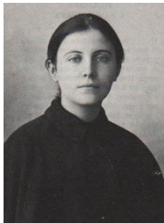
St. Gemma Galgani Feast Day: April 11