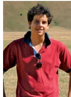
Bl. Carlo Acutis Feast Day: October 12