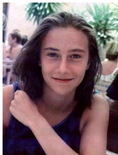
Bl. Chiara Luce Badano Feast Day: October 29