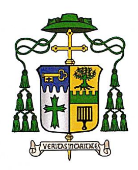
October 2, 2023