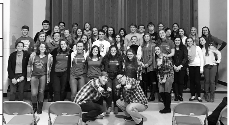
As you can see, we had a wonderful retreat this past Sunday with the students from Franciscan University of Steubenville. We spent the day in prayer, laughter and fellowship! A huge thanks to those who prayed for the success of this retreat. God is Good!

WORD OF LIFE—February 2017 "Whether it lasts for a brief moment or for a hundred years, each of our lives is a good and perfect gift. At every stage and in every circumstance, we are held in existence by God's love... Every life is worth living." USCCB Secretariat of Pro-life Activities