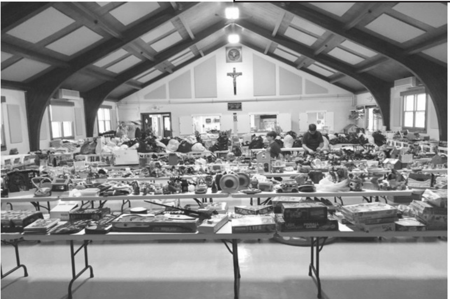
A huge thank you to all of you who sponsored a Samaritan Gifts for Kids angel. There were a total of 331 children in 135 families throughout the Conneaut School District (ages 13 and under) who benefited from this program. OLQA donated gifts or money for 115 of these children and provided many of the over 50 volunteers who helped this year. Many families expressed their thanks for having such a program. Here is just one example: "Thank you for your help with Christmas. My kids will truly have the best Christmas ever. And thanks for having all the wonderful helping people at pick up. They were all really nice and helpful."

You can "begin" at any time. There is an online component to help you catch up! All are welcome