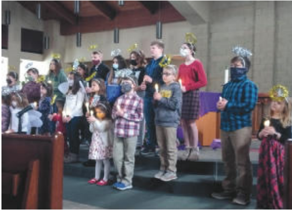
Our angelic children singing for us on Dec. 19th!

We will see everyone again for class on Sunday, January 9, 2022. Wishing everyone a Blessed Christmas Season and a very happy, and healthy New Year!