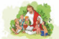
CHILDREN'S LITURGY AT SUNDAY MASS

Today's gospel teaches us UNCERTAINTY is normal. There are some things in life which "no one knows ... only the Father." Marriage and parenting are full of uncertainty for like the fig tree in the gospel, the people we love grow and change.