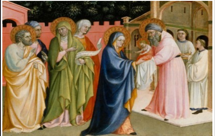
"The Presentation in the Temple" (circa 1430) by Portuguese artist Alvaro Pirez

We are all a bit like Mary and Joseph and the families bringing their child to God. We continuously stand before mystery of life. If we are open, we can hear the holy prophets remind us how and where God can be found in it.