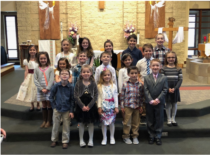
Our Kindergarten, First and Second Grades Sang "Jesus is Alive" at Mass on April 29!