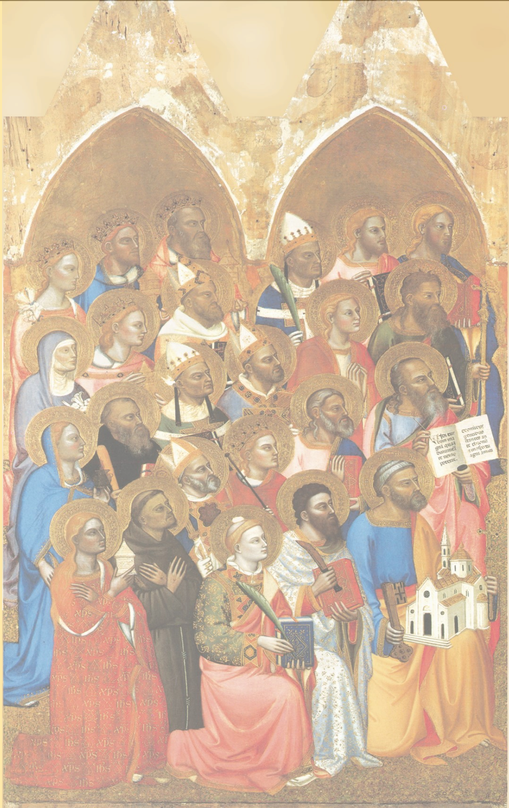
Cover design ©Liturgical Publications Inc. Image of Adoring Saints by Jacopo Di Cione © 2007 by Dover Publications, Inc.

Bulletin deadline: 10:00 AM Mondays, in writing, please.