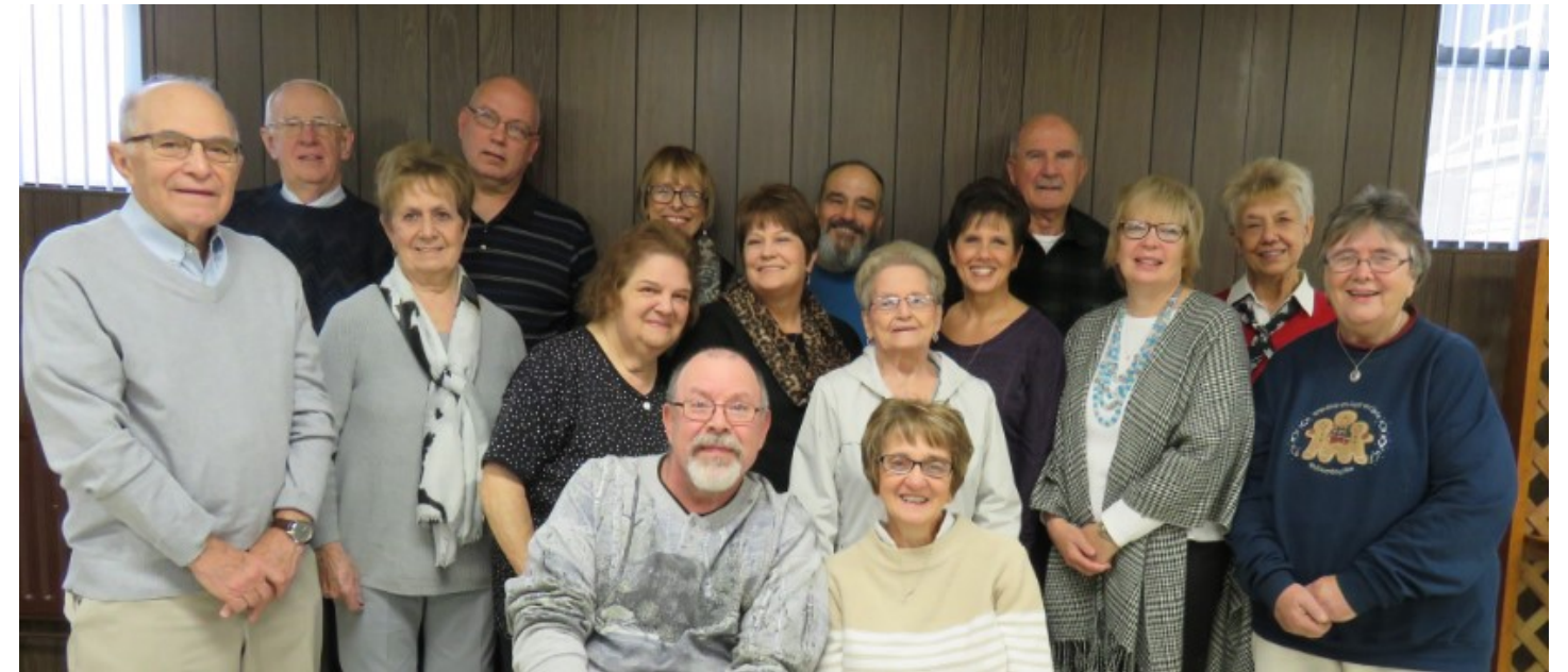
ABVM Altar Rosary Society Dinner Volunteers

April 22, 2018 ~ Fourth Sunday of Easter